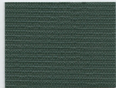
WTY5PRF Forest Green