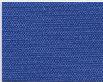
WTY416PRF Pacific Blue